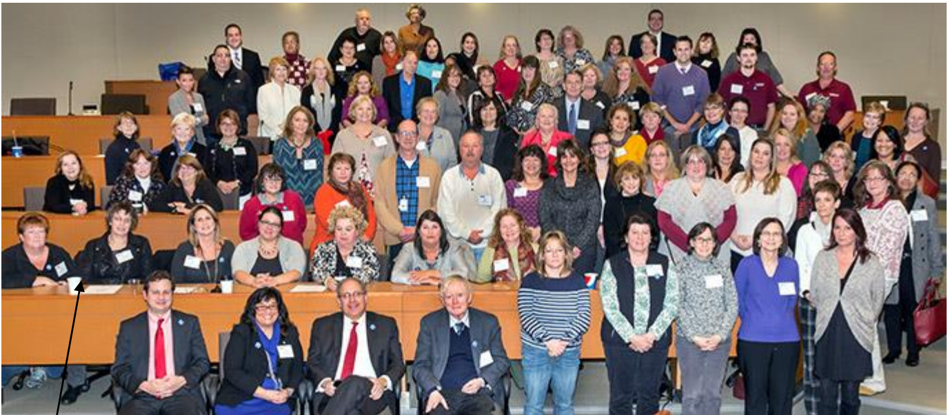
Look at the SABEA folks who took part in the NYSUT SRP recognition!